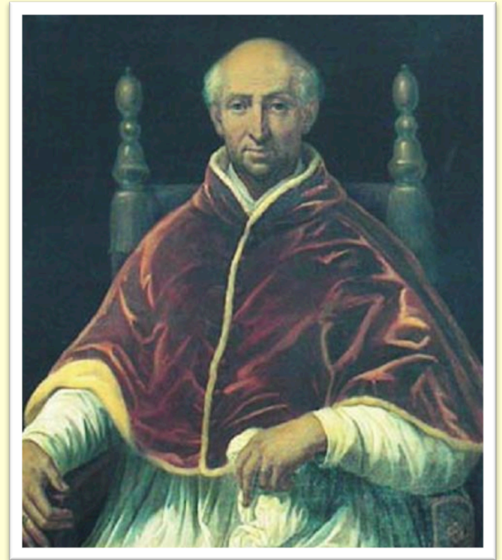
Pope Clement VI

Thrown into Seine in a sack by King of France because of his affair with the Queen