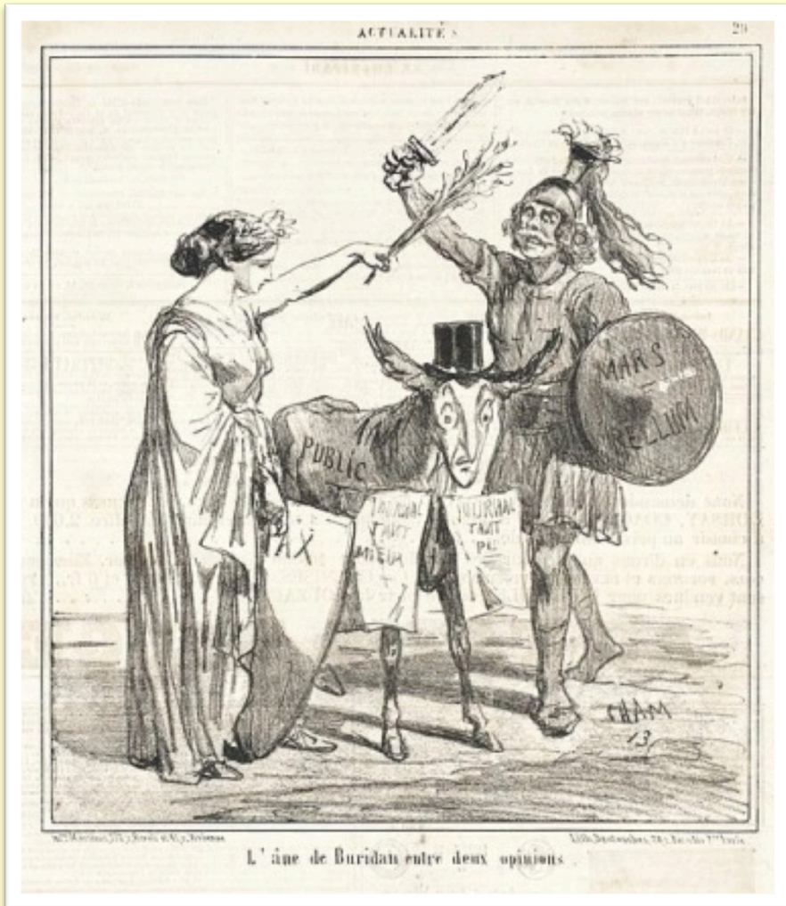
Cham, Le Charivari , 1859