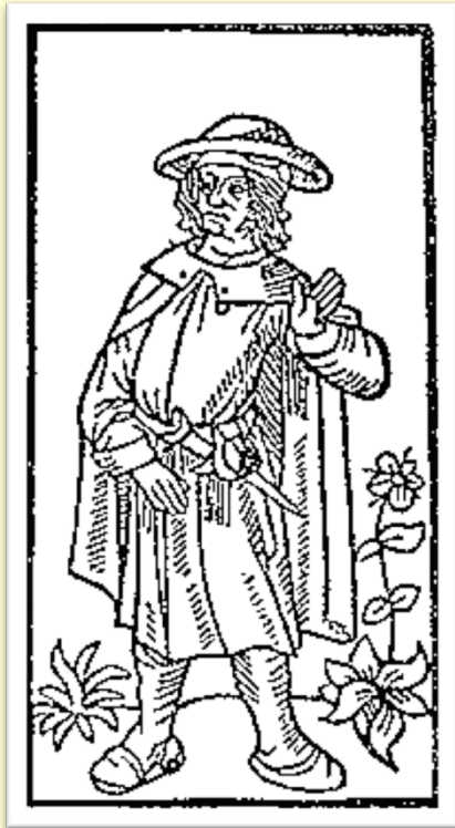
“François Villon”, 1489, Wikimedia Commons

Où est la très sage Heloïs, Pour qui fut castré et puis moyne Pierre Esbaillart à Saint-Denys? Pour son amour eut cest essoyne. Semblablement, où est la royne