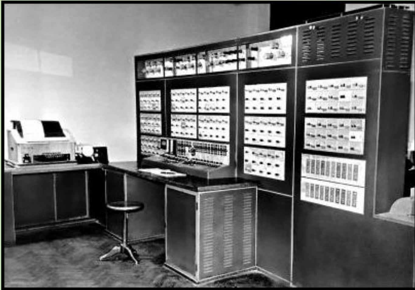
Setun Balanced Ternary Computer (Mosow State University 1958)

Some believe that Ternary Computing may make a comeback!